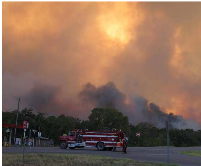
Wildfires can have significant economic and social impacts on communities.

As wildfires are growing in scale and duration, and increasing numbers of communities are affected, we need a clearer understanding of how wildfires affect economies and communities. Wildland fire impacts are often described in terms of lives threatened, structures and homes lost or damaged, overall suppression costs, and damage to the natural resource base on which many rural communities rely. This fact sheet shares results from two studies to illustrate economic impacts that reach beyond the primary indicators of suppression costs and homes lost. This information can help public officials, community leaders, and local citizens understand the larger wildfire impacts on economies and society.