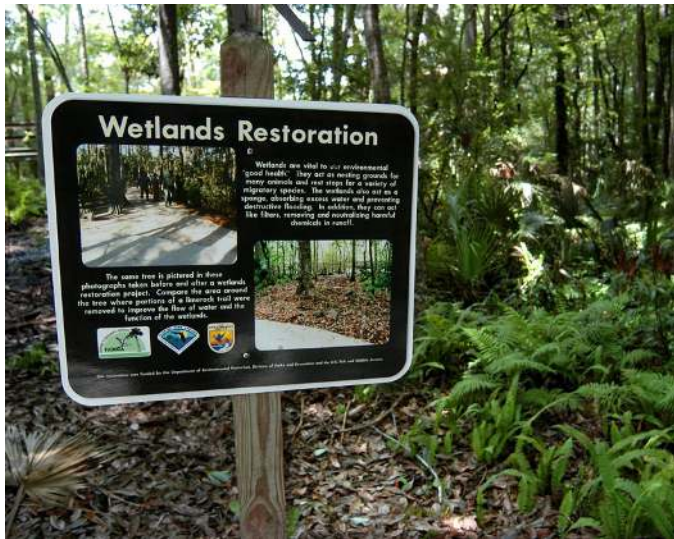
Post-fire management of natural areas often requires watershed restoration.

lines. Tax payers feel the squeeze on these repairs as each state typically reimburses the majority of costs incurred by the companies paying for the repairs.