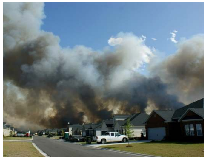
Communities feel significant impacts from wildfires when their homes are damaged or lost.

Wildfires impact communities in multiple ways, from closing natural areas that residents and tourists visit to damaging homes and harming residents or firefighters. Short- and long-term impacts on recreational activity are