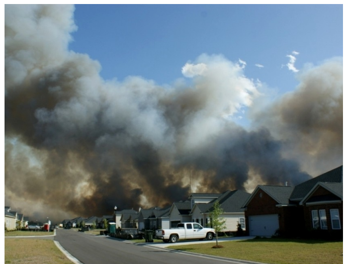
Communities feel significant impacts from wildfires when their homes are damaged or lost.

Wildfires impact communities in multiple ways, from closing natural areas that residents and tourists visit to damaging homes and harming residents or firefighters. Short- and long-term impacts on recreational activity are