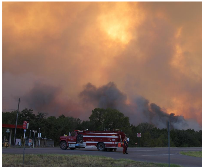
Wildfires can have significant economic and social impacts on communities.

As wildfires are growing in scale and duration, and increasing numbers of communities are affected, we need a clearer understanding of how wildfires affect economies and communities. Wildland fire impacts are often described in terms of lives threatened, structures and homes lost or damaged, overall suppression costs, and damage to the natural resource base on which many rural communities rely. This fact sheet shares results from two studies to illustrate economic impacts that reach beyond the primary indicators of suppression costs and homes lost. This information can help public officials, community leaders, and local citizens understand the larger wildfire impacts on economies and society.