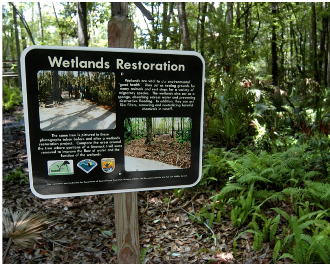
Post-fire management of natural areas often requires watershed restoration.

lines. Tax payers feel the squeeze on these repairs as each state typically reimburses the majority of costs incurred by the companies paying for the repairs.