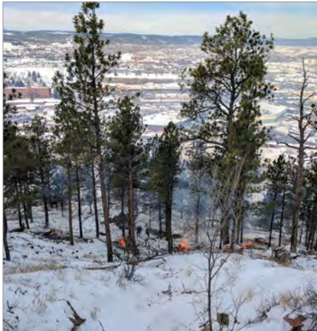
Prescribed burning on a municipal property in the center of Rapid City, SD.

FAC Net's investment in learning about fire adaptation approaches across the membership has yielded insight into the practices that are the most robust, deeply developed and transferable, and those that are in need of more exploration, or are uniquely suited to specific contexts. The few examples here highlight recent member projects that exemplify fire adaptation best practices, along with some that explore and test novel approaches.